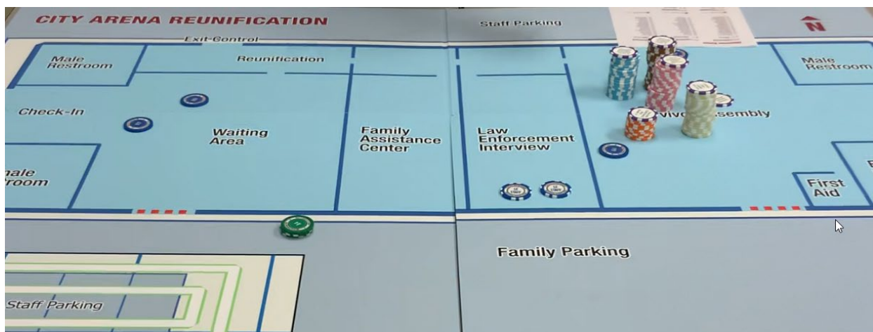
Photo: Tabletop Exercise Board of Student Reunification Center